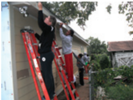
Northwood University's women's soccer team paint a house for Habitat for Humanity.