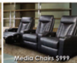
Media Chks $999

Experience the ... Joys of Christmas at Ben Franklin