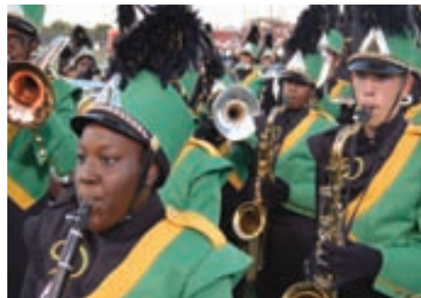
The DHS Eagle Marching Band entertains during a halftime show.