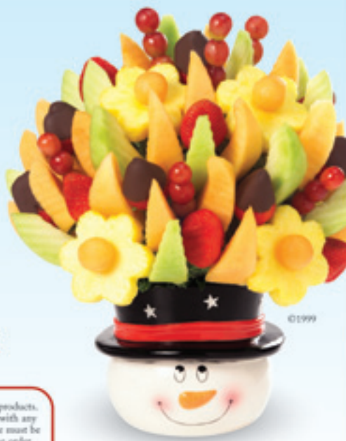
Delicious Fruit Design® Half Dipped in Snowman Keepake

Save $3 on your order when you mention this ad!*