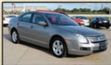
2008 Ford Fusion SE 12K Miles $14,888