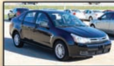
2008 Ford Focus Sedan 15K Miles, $12,886