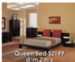
Queen Bed $2199 d/m 2 n/s