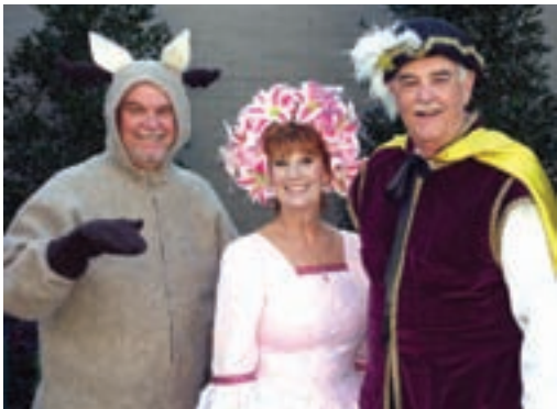
Rudi the Recycling Reindeer, Mother Nature and Recycle Man kick off the Toy Recycling Drive.