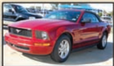
2008 Ford Mustang Convertible 26k Miles, $14,996

Ford vehicles only. Present coupon during write-up. Not valid with any other offer. Some models slightly higher. Expires 12/31/09.