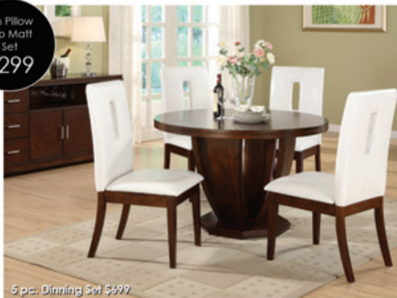
5 pc. Dining Set $699

Hwy 67 & Pleasant Run • Cedar Hill In Best Buy Shopping Center 972.293.6644 • www.blucci.com