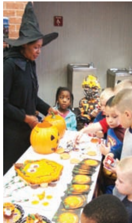
Local children enjoy Halloween treats at Zula B. Wylie Library.