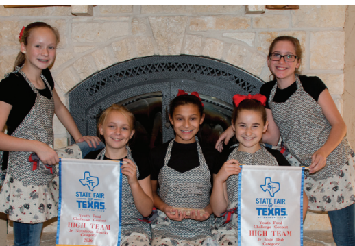
The Dawson 4-H Cooking Team proudly shows off its awards from the State Fair of Texas.

the food challenge. They were one of 22 teams that competed. Navarro County also won Reserve Champion with a team from Blooming Grove.