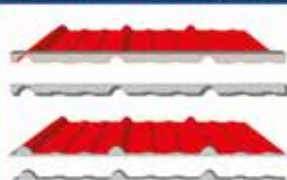
Universal & Vent Closures