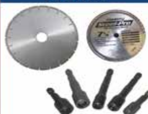
Blades & Hex Drivers