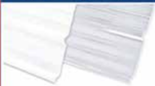
Polycarbonate Skylight Panels