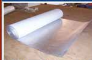
Vinyl Back & Reflective