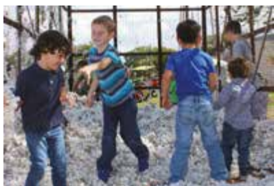
Kids enjoy old-fashioned fun at Keren's Cotton Harvest Festival.