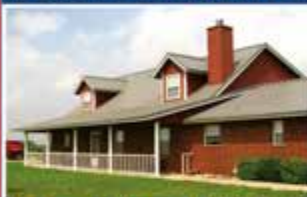
Residential & Commercial