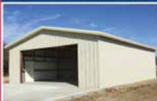
Pre-fabricated & Weld-up Buildings