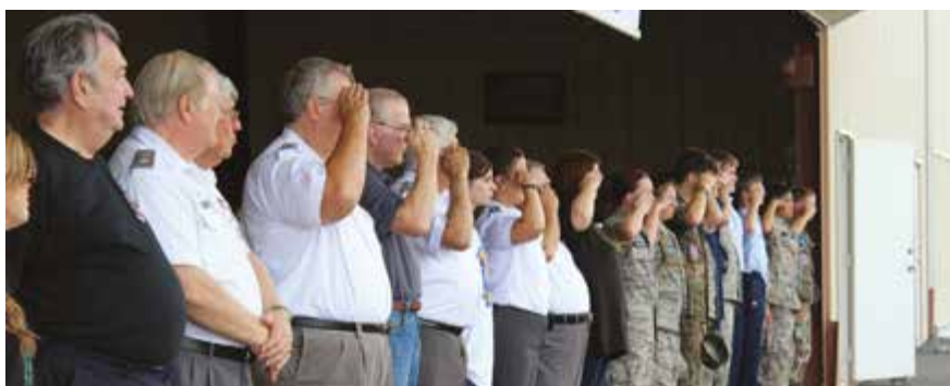
Visitors and members of Corsicana's Civil Air Patrol salute the color guard at the group's hanger open house.