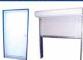
& Walk Doors