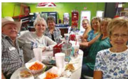
A happy group of Senior Circle members enjoy Bowlarama at the Bulldog Lanes.