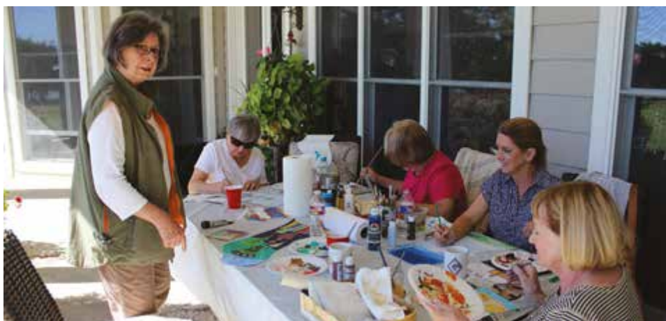
Corsicana Art League members are busily painting stockings to be presented to overseas military personnel.