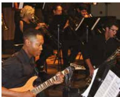
Navarro College's Bean's Big Band and Big Red Jazz perform in concert.