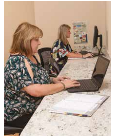
City Real Estate agents stand strong for buyers and sellers.