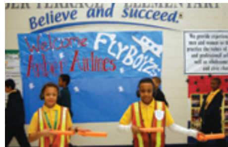
The Flyboyz meet with Amber Terrace students to discuss aviation and education.