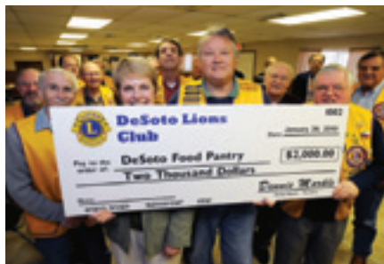
Lions Club presents $2,000 to DeSoto Food Pantry.