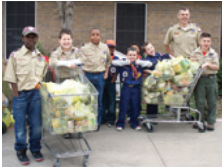
Cedar Hill Scouts collect over 2,600 food items for Cedar Hill Fire Department.