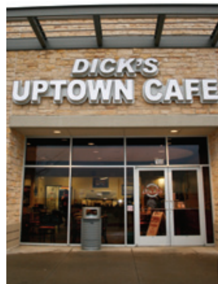
Teril and Dick Woodward, owners of Dick's Uptown Cafe.

Opening for breakfast on Sundays sometime in April.