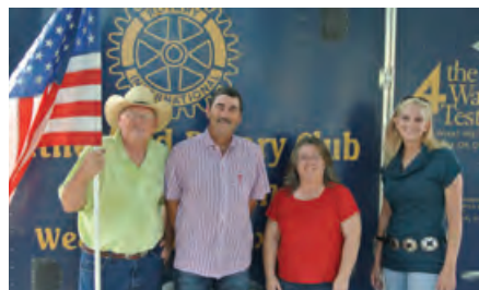
Rotary Club of Weatherford members pick up the Stars and Stripes on Flag Day.