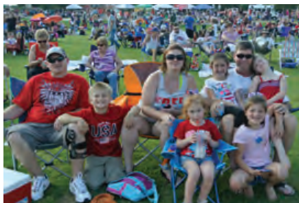
The Fields family enjoys an evening at Boomin' 4th.