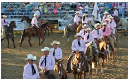
The Parker County Sheriff's Posse rides at the Frontier Days PRC A Rodeo.