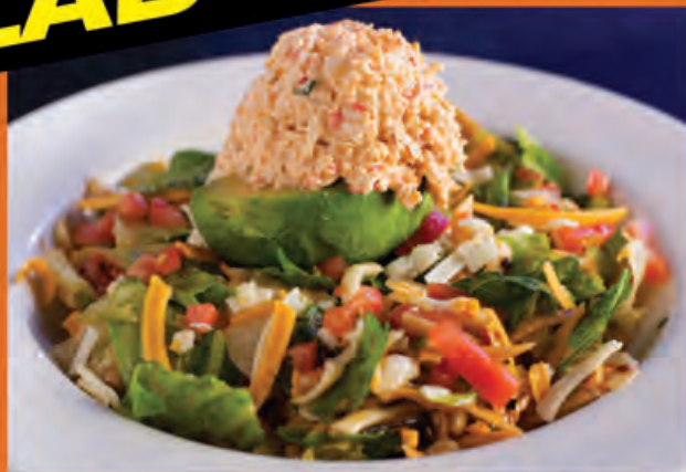
Stuffed Avocado Salad