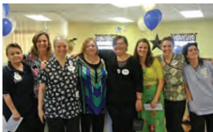
These Weatherford Healthcare Center employees get their share of the $35,000 Blue Ribbon award.