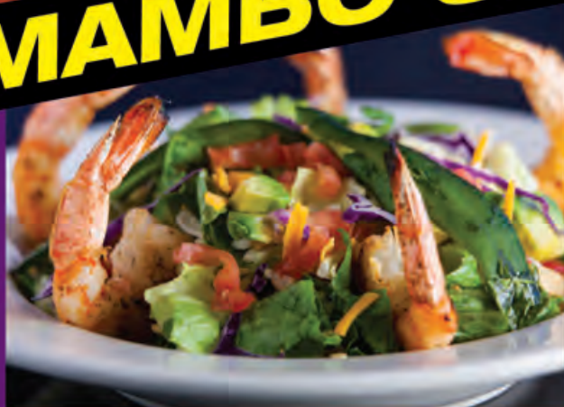
Grilled Shrimp Salad