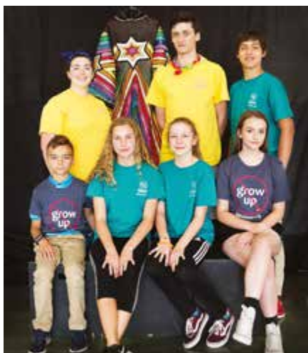
Burleson kids join other local actors and Kids Who Care alumni on stage for Joseph and the Amazing Technicolor Dreamcoat.