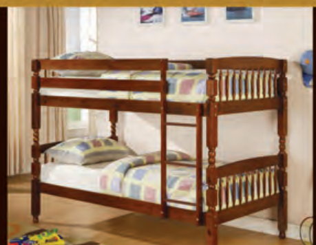
Twin Bunk Beds $238