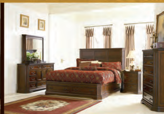
Foxhill Collection $1095*