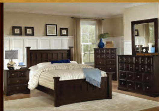
Harbor Collections $868*