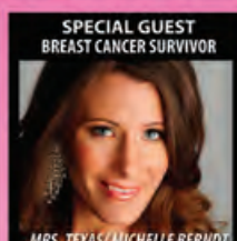
SPECIAL GUEST BREAST CANCER SURVIVOR