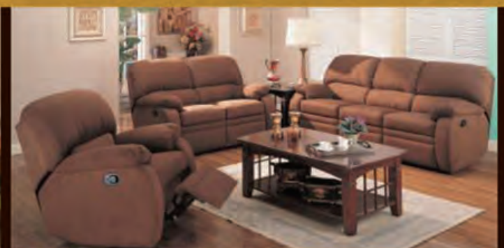
Chocolate Motion Sofa & Love Seat $998