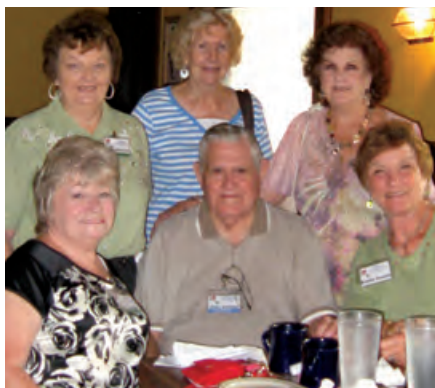
A small group gathers at one end of the banquet table at Our Place during the weekly breakfast meeting of Widowed Persons Service of Tarrant County.