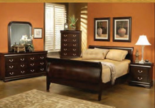
Wiesman Collection $648*

Thank You for all your support. Come see us at any of our locations.