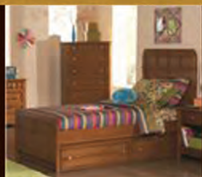
Aiden Collection $778**