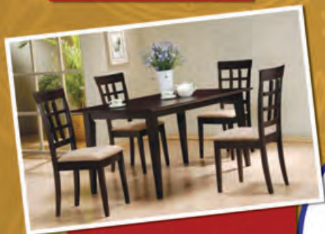
Cappuccino Dining Table with 4 chairs $298